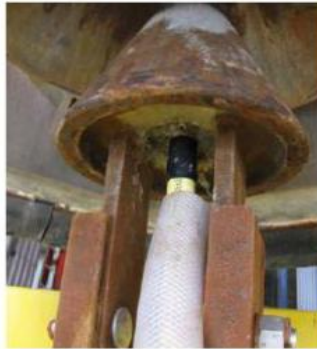
Two months after the cast was made. The strands show signs of being pulled into the cone. (Random picture available from system)