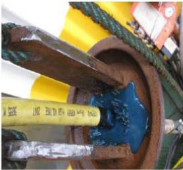
Picture of cast taken after re-termination

A member has reported an incident in which a remotely controlled vehicle (ROV) and its tether management system (TMS) were dropped to the seabed following failure of the umbilical termination. During recovery of the system, just as the bullet was about to enter the docking head in the A-frame, the umbilical separated from the TMS and both the ROV and its TMS were dropped to the seabed. Immediately after the incident occurred, all electrical power to the ROV was switched off and high voltage equipment was earthed according to procedure. The incident occurred three months after the latest umbilical re-termination.