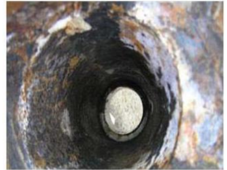
The surface of the inner cone was corroded and rough, although loose rust was removed