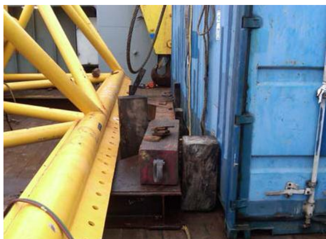
Injured person's ankle was trapped between yellow spreader bars and blue freight container

Following investigation, the company noted the following: