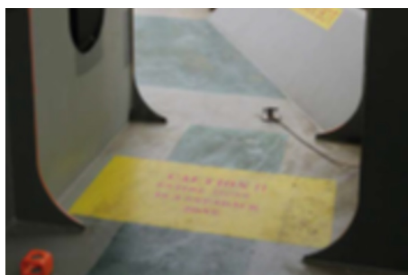
Where the warning sign appears on the floor