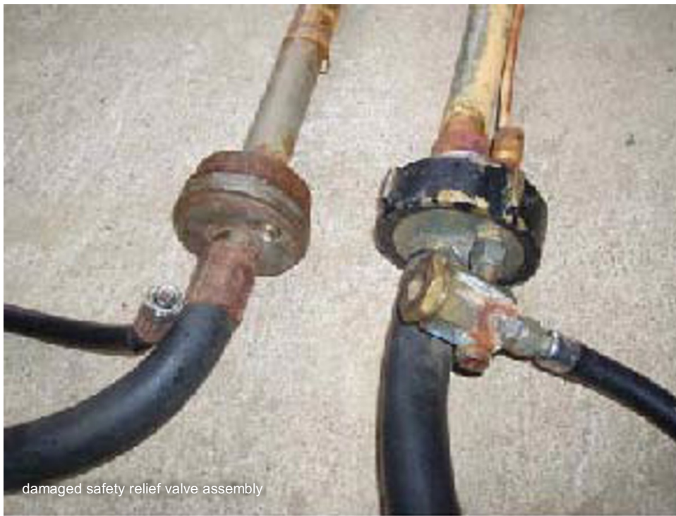
damaged safety relief valve assembly