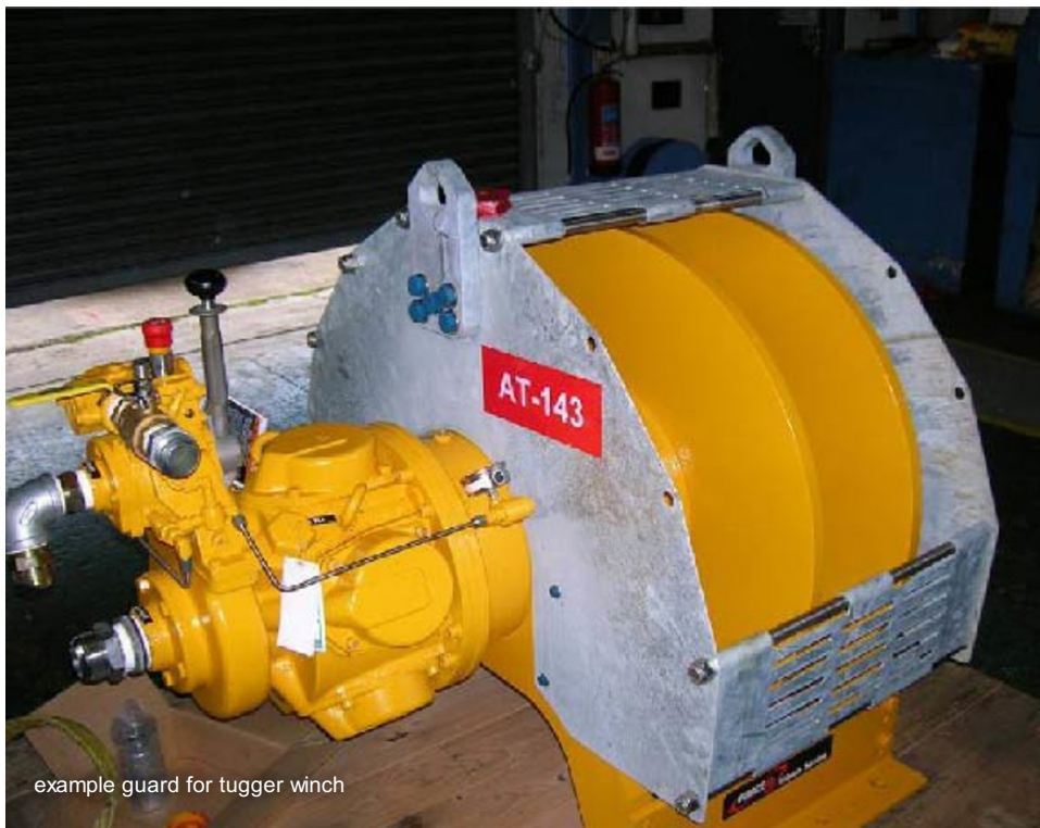
example guard for tugger winch

IMCA Safety Flashes summarise key safety matters and incidents, allowing lessons to be more easily learnt for the benefit of the entire offshore industry.