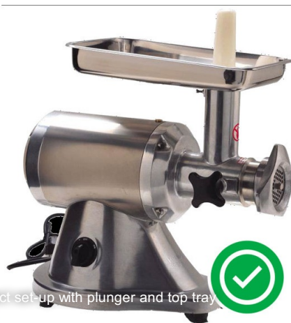
(L) Incorrect set-up with no plunger or top tray (R) Correct set-up with plunger and top tray