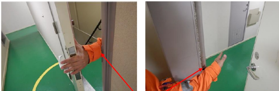
Left sleeve of the boiler suit caught on the door locking slot in the door jamb