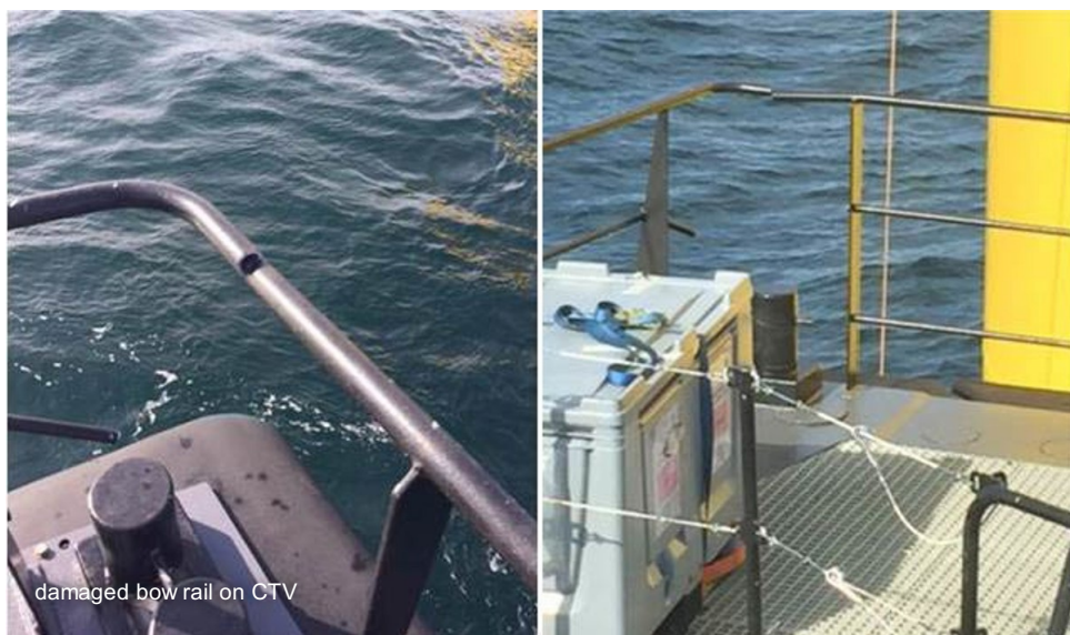
damaged bow rail on CTV

Unknown to the Master, as his vision was very restricted with a large grey storage box on the foredeck, the riggers had pulled the line over the top rail and made fast to the bollard below. The rope drew tight and personnel positioned themselves away from the bow to avoid the snap back zone. The rope did not snap but it cut through the top rail and broke the middle rail off completely.