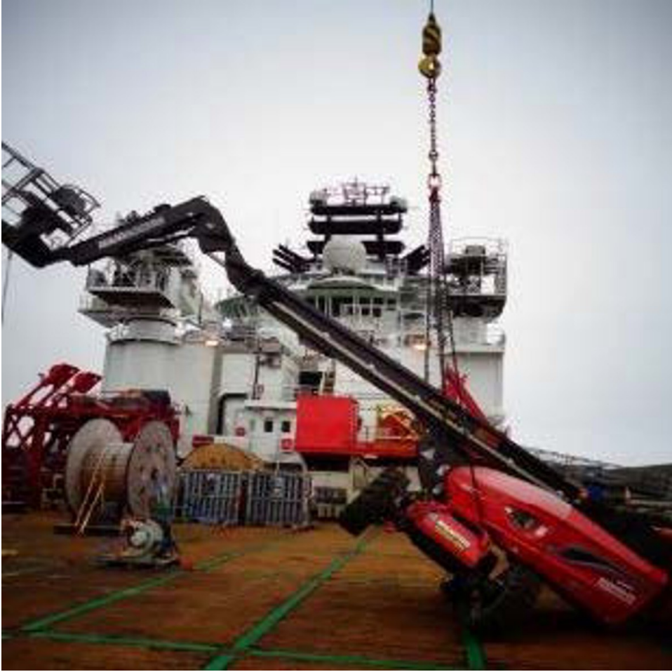
Cherry picker incorrectly rigged