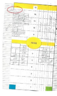
Deck cargo plan