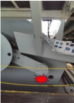
“A” deck – the place from which the bosun fell, illustrating the chain he potentially stepped on